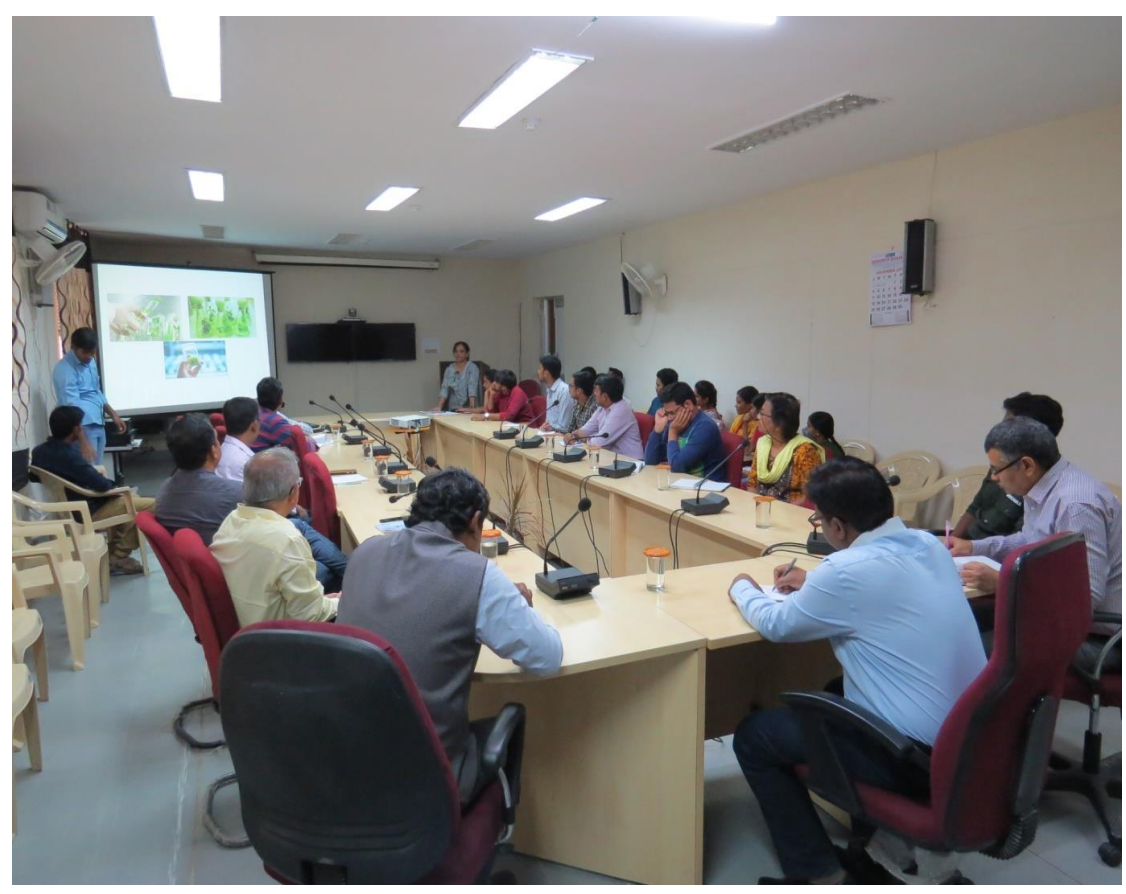
Presentation in Seminar Hall